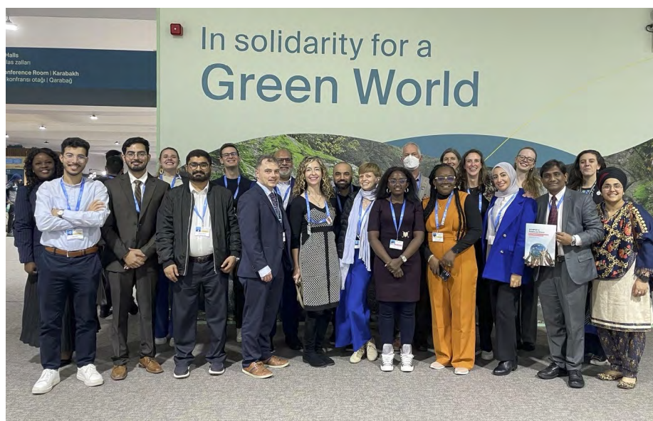
Photo 3. WMA collaborations with global health professionals, as part of the Global Climate and Health Alliance, in November 2024.