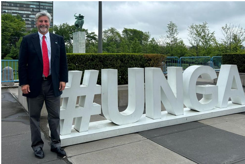
79th Session of the United Nations General Assembly in New York UN High-Level Meeting on AMR on September 26th