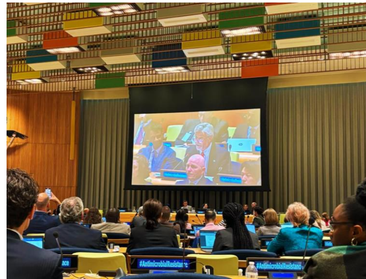
Multistakeholder Hearing at the United Nations on Antimicrobial Resistance